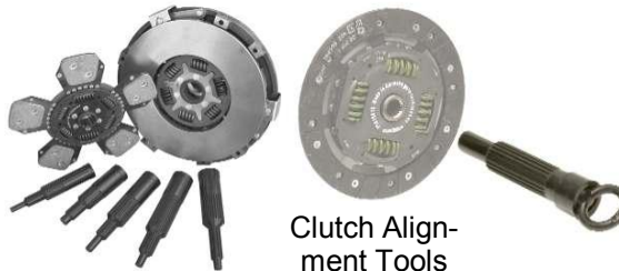
Clutch Align- ment Tools