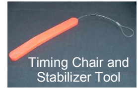
Timing Chair and Stabilizer Tool